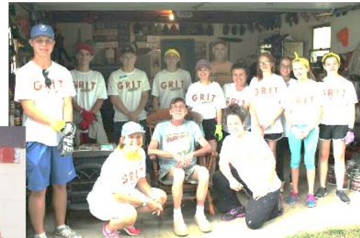
They met new Friends from all over!