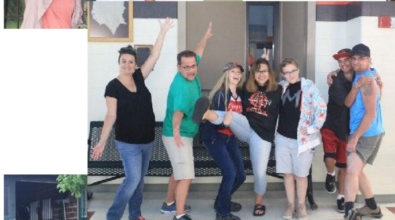
They learned new skills!