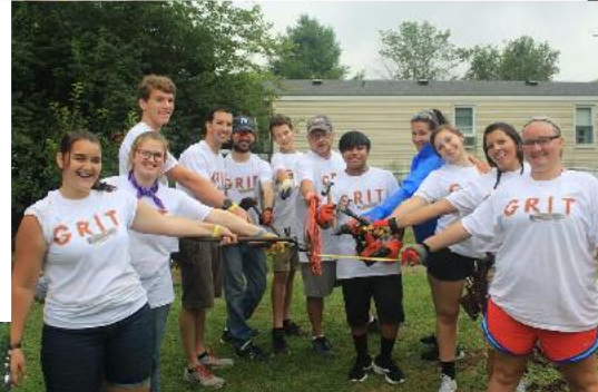
And they had some fun!